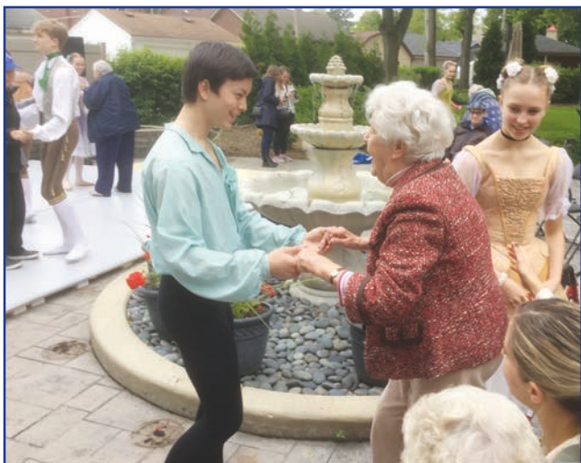
The charming students from The Royal Danish Ballet Youth Company, Kompagni B, danced with The Danish Home residents and visited with guests on Sunday, June 16, 2019 at The Danish Home of Chicago.