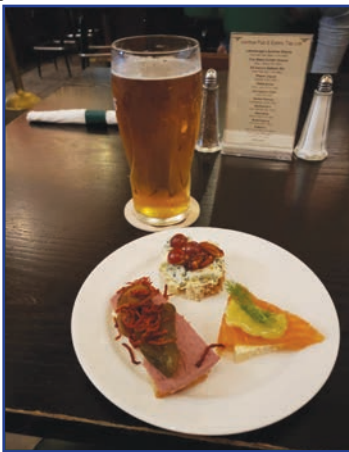
All enjoyed the Danish dinner.