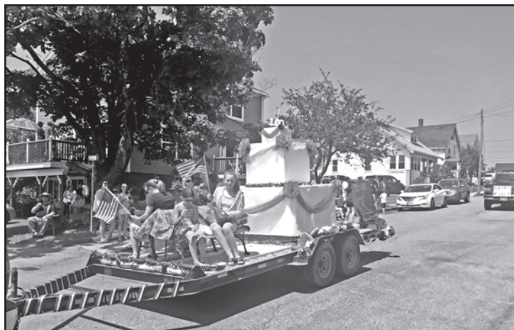
The Fourth of July Parade itself before the dinner.

with sophisticated musical entertainment.