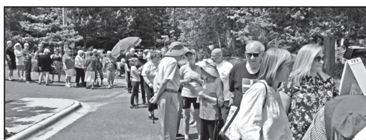
The line formed to come and select the smørrebrød of one's choice!